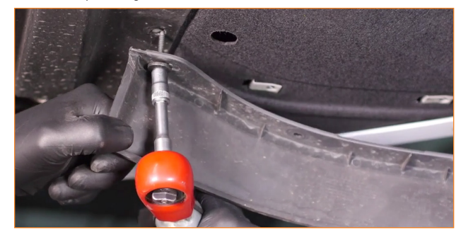
CONTINUED ON FOLLOWING PAGE