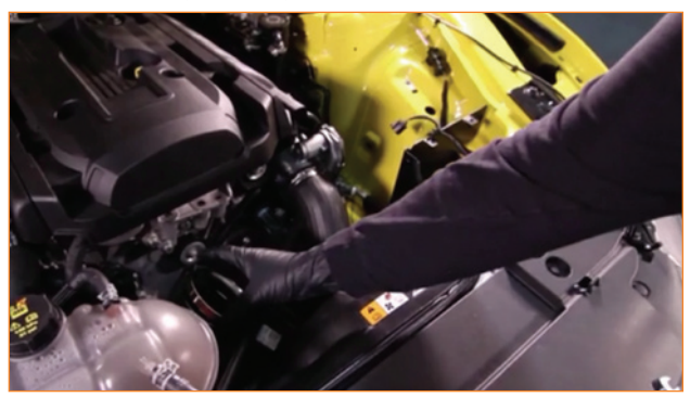
24. Remove the tree clip holding the wire harness to the body of your Mustang.

23. Attach the large worm-gear clamp to the hose.