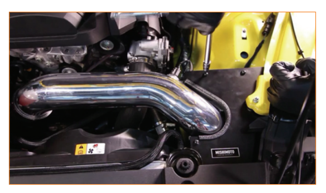
34. Please place the included CARB EO sticker in a clean, visible location. After that you have now successfully installed the Mishimoto 2015–2017 Ford Mustang EcoBoost Performance Air Intake. Enjoy!

33. Insert the airbox lid and press firmly. Attach the lid to the airbox using the supplied Mishimoto 4mm black button head bolts and nylon washers.