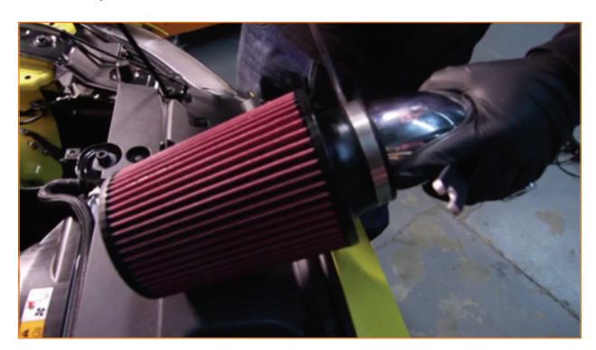
21. Attach the upper rubber bushing to the intake pipe. The unused threads must be facing upward. [10mm ratchet wrench]

20. Attach the filter to the aluminum intake pipe, and tighten the filter into place. (flathead screwdriver)