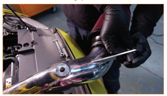
22. Reinstall the IAT sensor by pushing on the opening of the pipe and then turning clockwise until it stops. Gently pull upward to be sure that the IAT sensor is seated correctly.