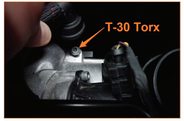
4. Rotate the stock turbo inlet pipe clockwise (towards the firewall) and then pull it away from the turbocharger to remove.

3. Loosen the T-30 Torx bolt securing the stock turbo inlet pipe. This bolt is a captive fastener and should not be removed from the turbocharger. (1x T-30 Torx bolt)