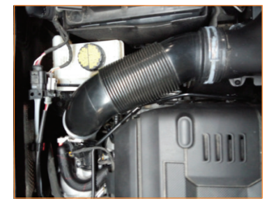
Congratulations! You have finished your installation.

8. Reinstall the air intake tube. (1x worm gear clamp, 1x spring clamp)